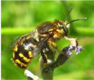
Wool Carder Bee