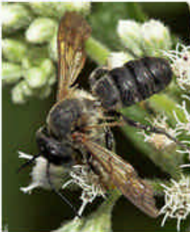
Giant Resin Bee Introduced species; 1/2 - 1 inch long; longer and more cylindrical than carpenter bee