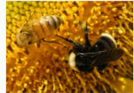
Above - Honey bee on the left and bumble bee on the right