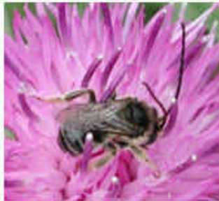
Melissodes Bee (Above and below) Very long antennae