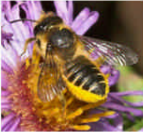
Female leaf-cutter bee Pollen carried under the abdomen, not on legs

This includes any bees you observe that don't fit into the other four categories. Some common 'other bees' are shown below.